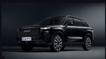
Carbon Crystal Black