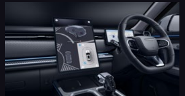
540° Panoramic Image