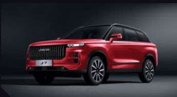
Black and Red