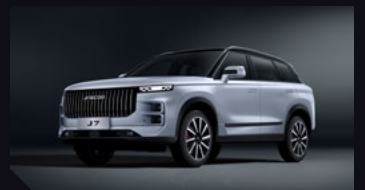
Moonlight Silver and Black