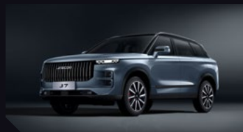
Olive Grey and Black