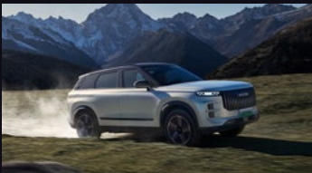
7 Driving Modes

The Jaecoo J7 exudes sophistication, inside and out. It delivers both power and premium aesthetics, making every journey effortless. Subtle yet striking, the retractable handles showcase fluid design harmony. A true mark of classic elegance, Jaecoo’s signature Waterfall Grille features bold vertical chrome bars, adding to its distinctive presence.