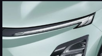
T-shaped LED Headlights