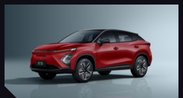
Martian Red w/ Black Top