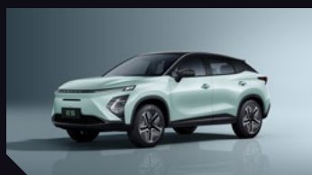
Titan Green w/ Black Top