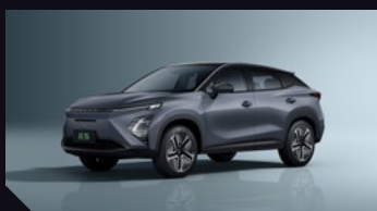
Mercurial Grey w/ Black Top